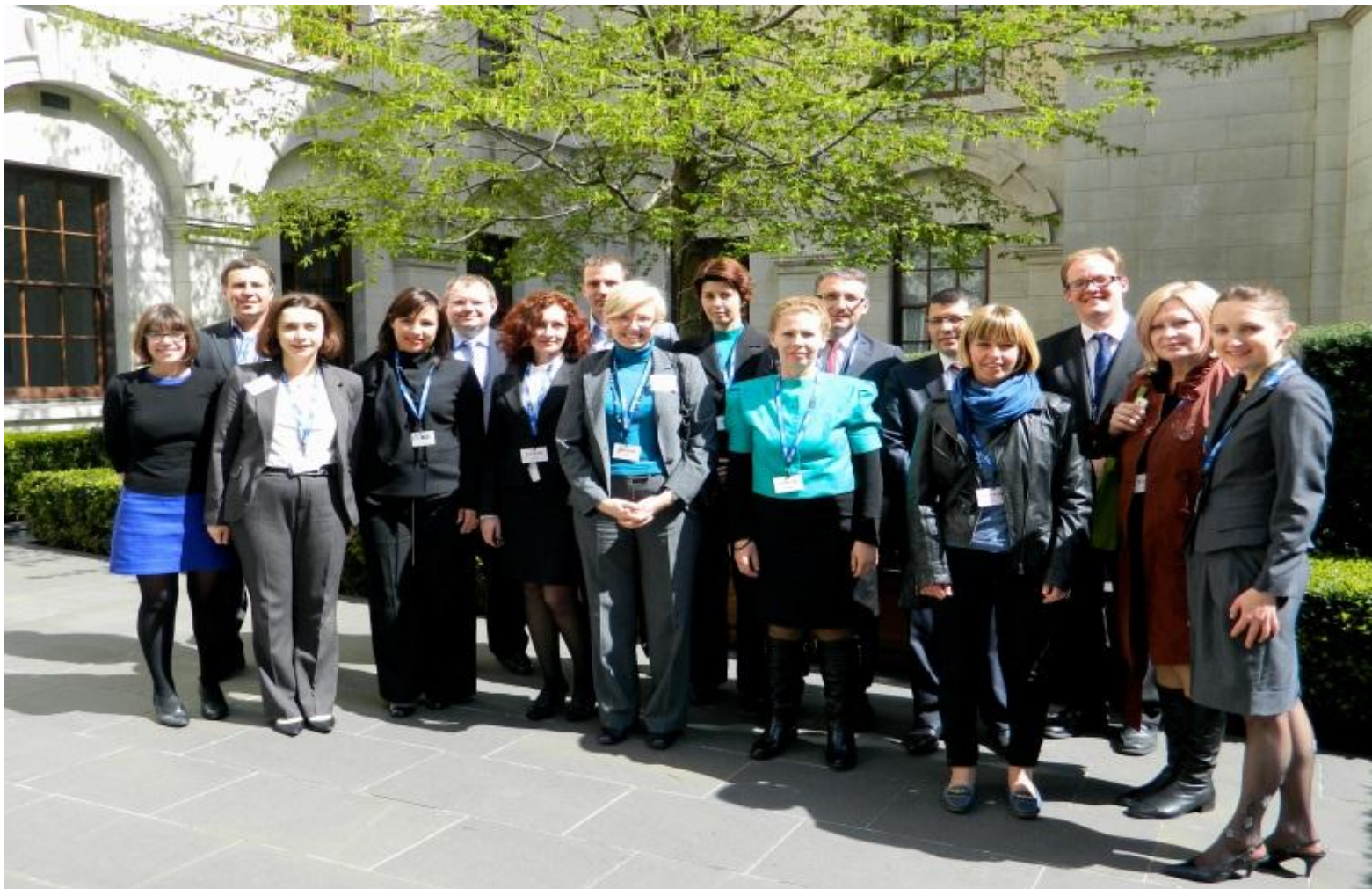
At UK HM Treasury – April 2013