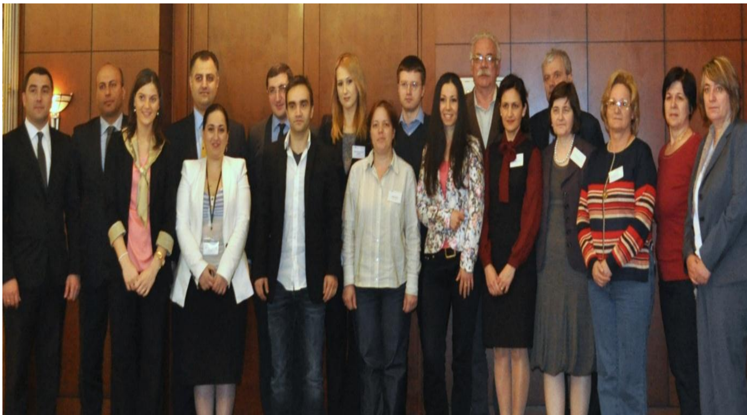
Study visit to Georgian MoF, April 2013