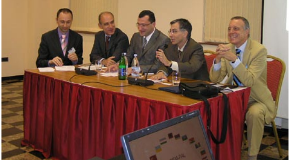
Welcome and opening, October 21, 2009

At the request of the participants the focus of the discussions of the plenary workshop was on specific topics identified by the participants during the last IA COP workshop in April 2009 in Ljubljana. included, among others, standards, IA processes, and IA training and certification. The workshop also focused on issues relevant to the development of Armenian Internal Audit. promote exchanges participants, the format for most of the discussions was case studies presented by participants. For that purpose, the organizers have been in touch with selected delegations request to preparations of these. In addition to sharing knowledge, we also further reinforced the Community of Practice for the internal auditors as part of the PEM-PAL Program.