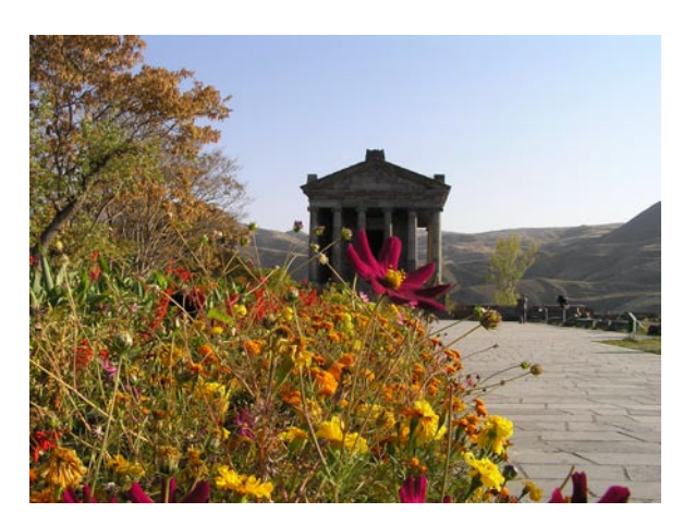
Garni Temple, Armenia