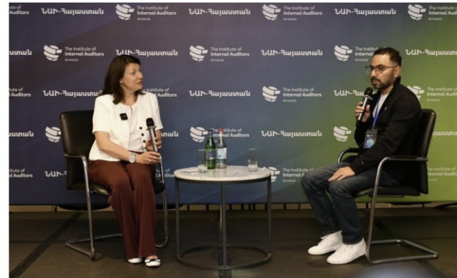
Internal Audit and Transformational Coaching November 18, 2024