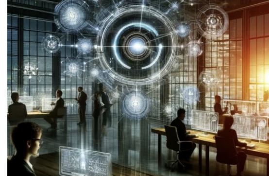
Ռիսկերի վրա հիմնված Ներքին աուդիտի սկզբունքները (մաս II) February 7, 2025